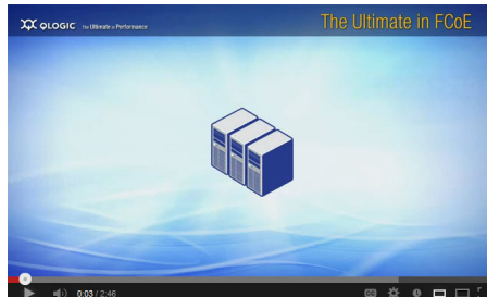
The Ultimate in FCoE

Click on the video link to see why QLogic adapters are the ultimate in FCoE.