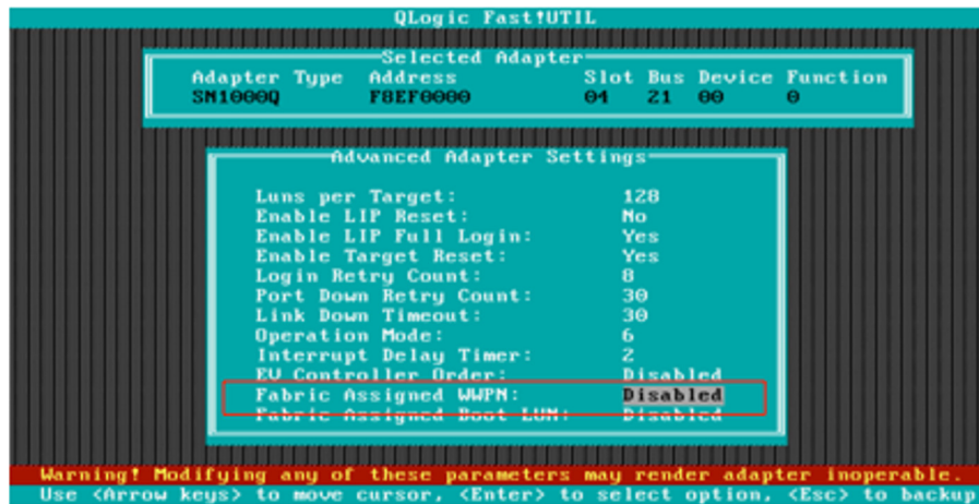
Figure 4-3. Fast!UTIL: Fabric Assigned WWPN