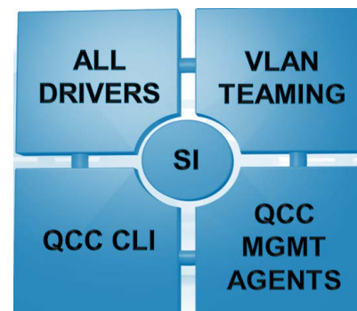
Figure 3. Components of SuperInstaller (SI)