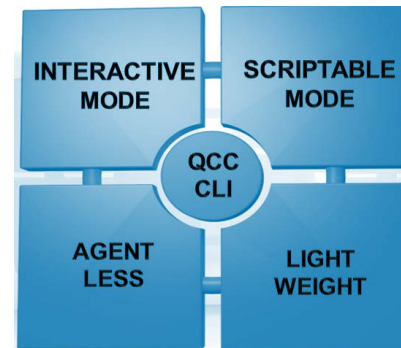
Figure 2. Key Features of the QCC CLI

QCC CLI provides a lightweight, text-based interface for managing generations of QLogic adapters from Cavium. Restricted to local mode adapter management for enhanced security, the QCC CLI provides both interactive modes for IT administrators who are unfamiliar with the syntax and a scriptable mode with a rich set of commands and options for scripting. QCC CLI is available for Windows, Linux, and Solaris environments and is available as a standalone package for installation, or it can be installed as part of the SI.