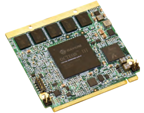
CN71XX based Qseven module

The OCTEON III CN70XX/CN71XX families of multi-core cnMIPS64 processors integrate single to quad cnMIPS64 v3 cores with virtualization capabilities and hypervisor support. These highly-integrated SoCs include a rich set of I/O's and Cavium's advanced hardware acceleration for packet processing, security, deep packet inspection (DPI), offering a power, performance, and price-optimized solution for next-generation platforms.