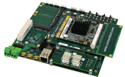
Qseven Module Develop platform